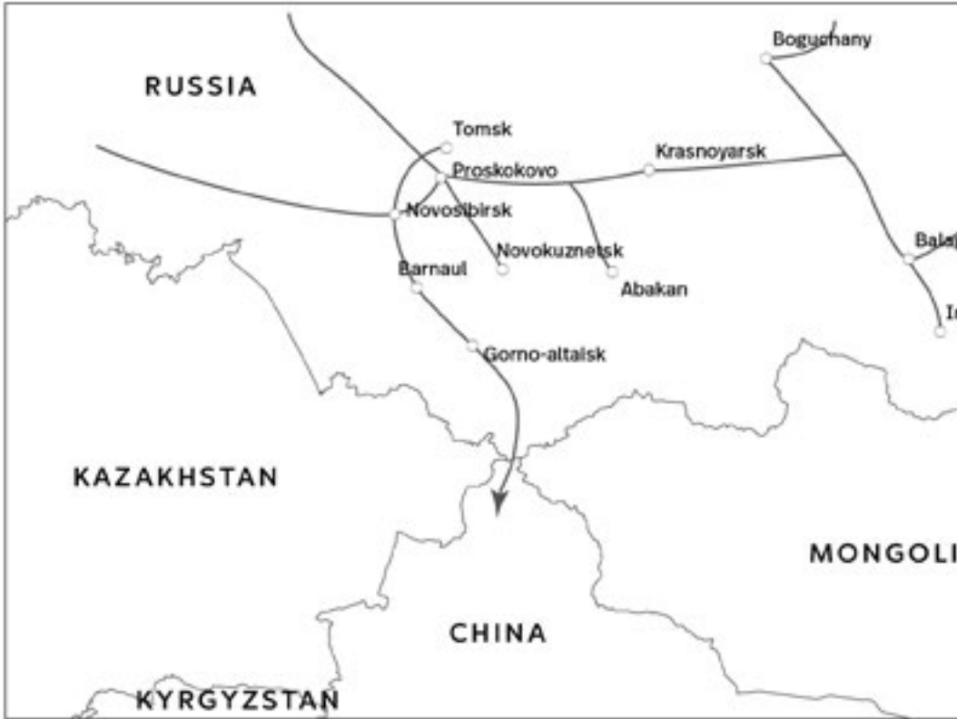
Map 1. Eastern and Western Gas Pipeline Routes from Russia to China

the Power of Siberia (PoS) pipeline, a unified gas transmission system from the Yakutia gas production centre (the Chayanda gas field), which should convey gas via Khabarovsk to Vladivostok, on the Pacific coast. A pipeline spur to China from the border point of Blagoveshchensk is part of the project. The Vladivostok LNG terminal is to be constructed at the end of the gas pipeline in the Khasan District of the Primorye Territory (see map). The terminal should comprise three production trains with an annual capacity of 5 mt/y each. With a length of 4000 km the PoS is expected to have an annual capacity of 61 bcm: 38 bcm is planned for China, 9 bcm for the domestic market and 14 bcm as an LNG to other Asian customers. 6