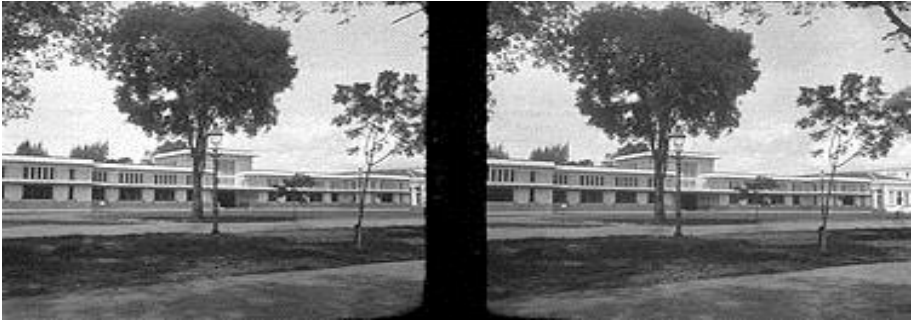
Law School in Jakarta 9

In brief, the constitution sets the materials given in the education of bachelors of law in RHS Batavia, which are: